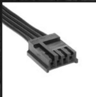
1x Floppy power connector