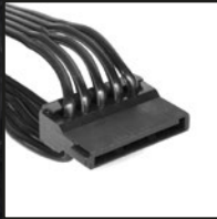
4x SATA power connectors