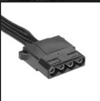
2x 4 pin IDE power connectors