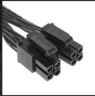
1x 4+4 pin CPU power connector