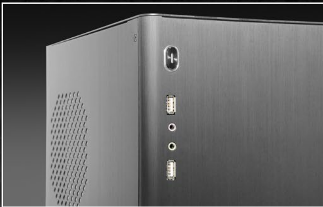
Front I/O: 2x USB2.0, 2x audio